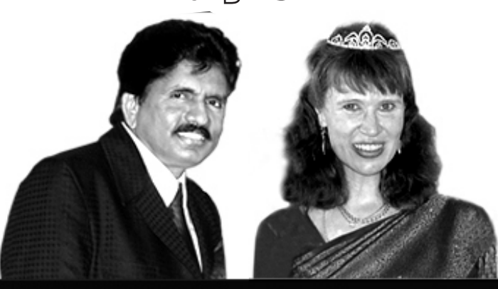
By Counselors, Co-ordinators, Partners and Staff